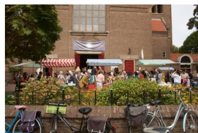
Impressions of the Wageningen Parish Day of 2016 and 2017

Please continue 'your work as a missionary',